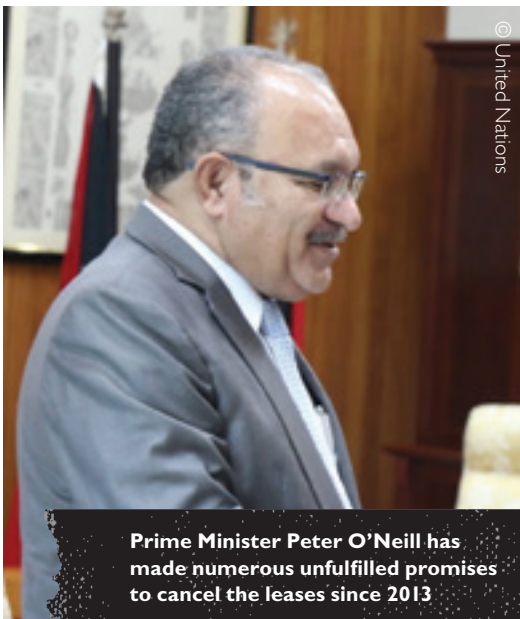
Prime Minister Peter O'Neill has made numerous unfulfilled promises to cancel the leases since 2013

Primary responsibility for the lack of forward movement over the last several years must rest with the Prime Minister and the Ministers for forests, lands and agriculture who were initially appointed by the Prime Minister 25 to implement the COI recommendations.