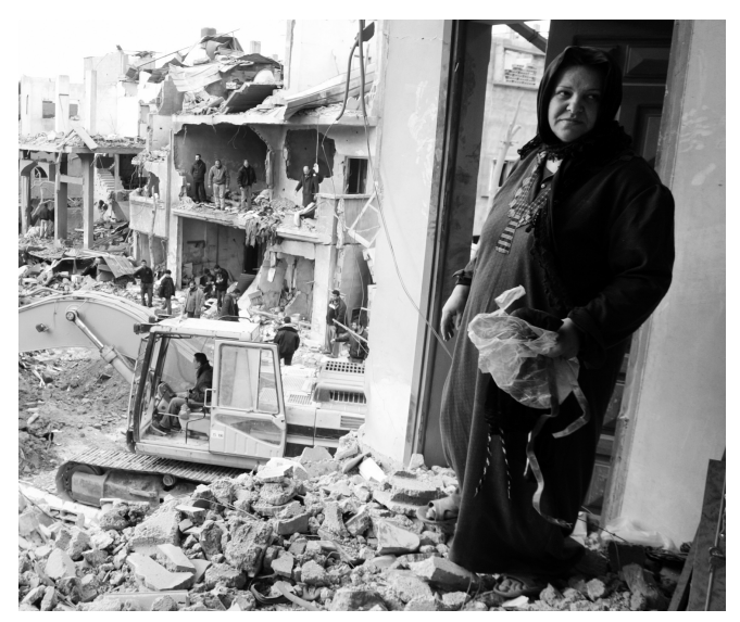
A Palestinian woman surveys her destroyed house after an Israeli air strike in Jabalya on 2 January 2009.

Israel's occupation of Palestinian territory provides a central focus of tension in Middle East politics. Since the outbreak of the second intifada in September 2000 Israel has intensified its military action against Palestinians living under the occupation, leading to a human rights and humanitarian crisis. As a result of the occupation, 70% Palestinians are now living in acute poverty and over half are dependent on food aid.