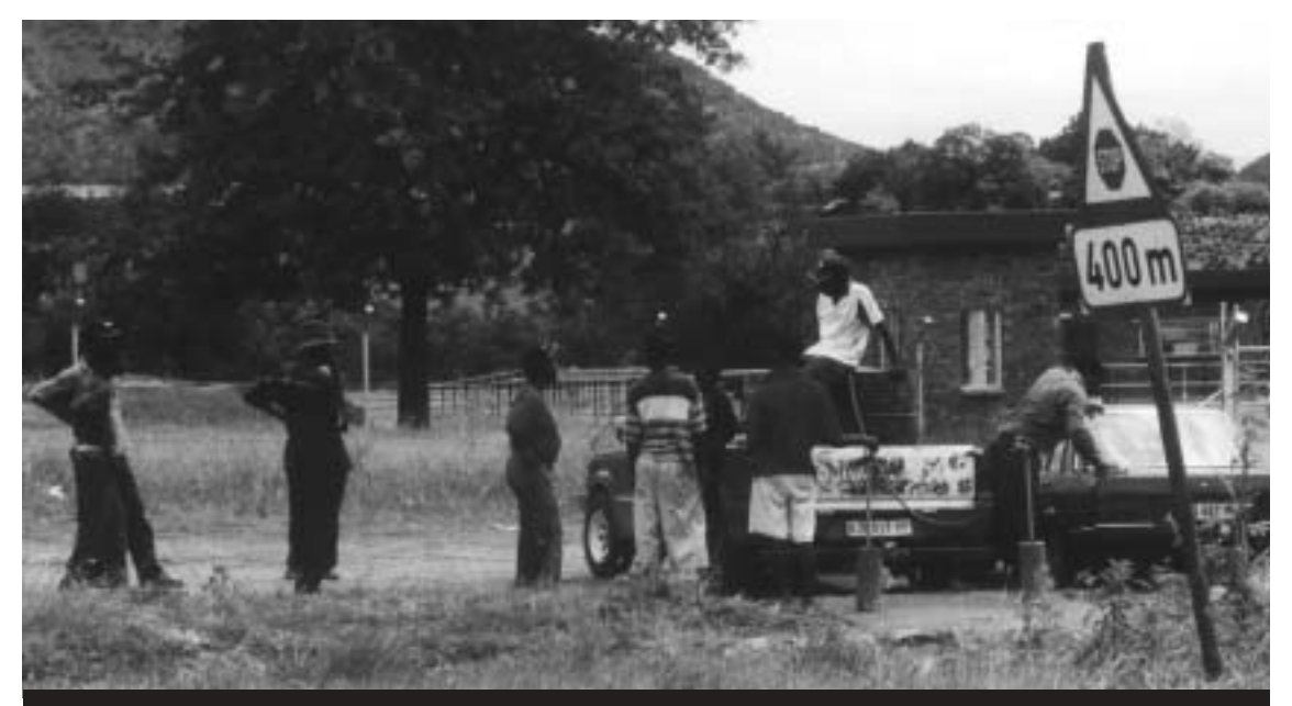
People collect water near Nelspruit due to lack of provision

workers because Bi-Water only had to guarantee conditions for existing workers at the time it privatised.